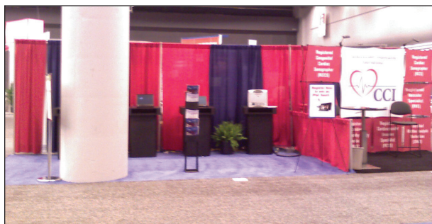
Exhibit Hall Carpet Logo

Maximize your company's brand recognition on the exhibit floor with Exhibit Hall Carpet Logos. This sponsorship opportunity provides your company with specific, value-added exposure to your core market. Whether you are looking to increase brand recognition or drive attendees to your booth, Exhibit Hall Carpet Logos will help you achieve your goal.